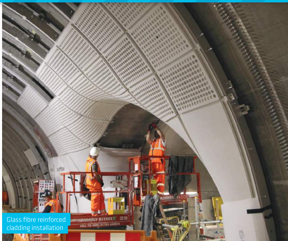
Glass fibre reinforced cladding installation